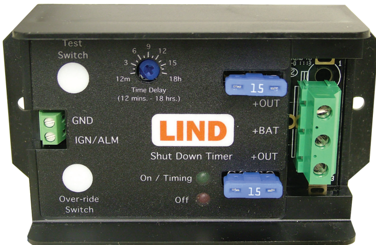
Terminal Block Output *

* Both versions shown with optional fuses.