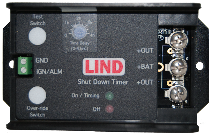
Screw Terminal Output *