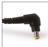
Plug into input power jack of laptop or device