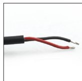
Input Power Connection

For safety, it is recommended to install a disconnect plug on the input wires.